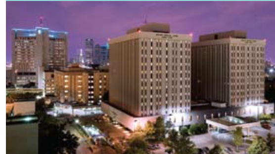
Baylor University Medical Center at Dallas Baylor All Saints Medical Center at Fort Worth

With one phone call, a physician can request additional information, an appointment for a patient, or a consult. Call 1-800-774-2487 and a Baylor Regional Transplant Institute representative will assist you.